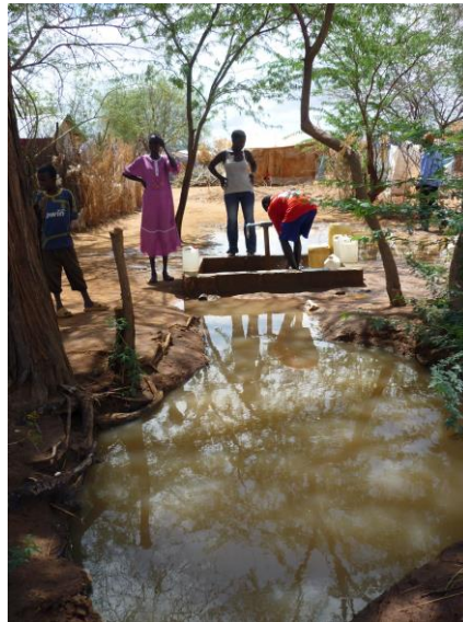
Dadaab Refugee Camp, Kenya. 2011.